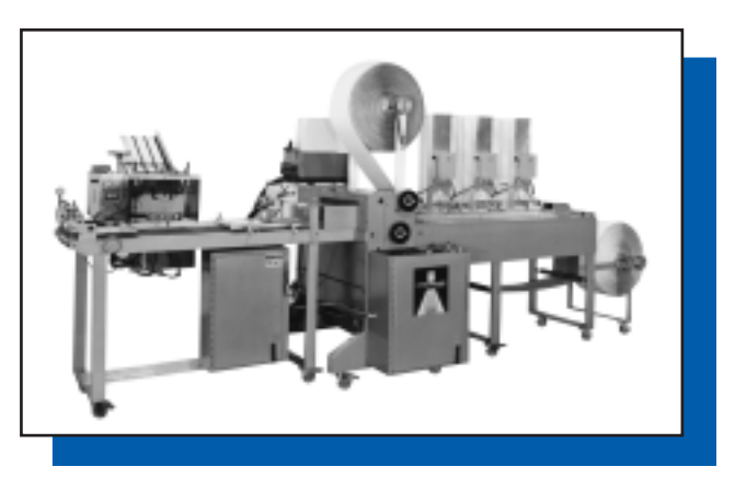
Purchase of some options may change specifications and requirements